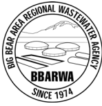
Exhibit “B” Public Records Request Fee Schedule